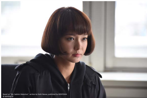
Ms. Sadistic Detective

The Last Cop takes a different spin on the buddy cop theme and features Toshiaki Karasawa and Masataka Kubota respectively as a brash, bossy detective freshly awakened from a 30-year coma and his stickler-for-the-rules partner, with the pair often at odds with each other due to their opposite personalities. The series will premiere on 21 September and airs every Wednesday and Thursday at 9pm.