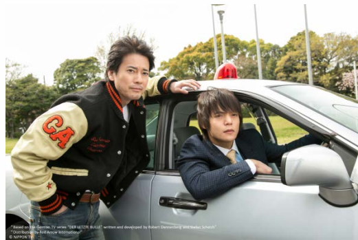
The Last Cop

Guard Center 24 premieres on 16 September at 8pm at the same time as Japan, first and exclusively on GEM (Singtel TV Channel 519).